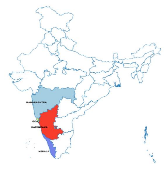
Fig.1 KFD affected states in India

district of Tamil Nadu state. Monkey deaths and human cases have now been reported from three neighbouring states bordering Karnataka viz., Wayanad (2013) and Malappuram districts of Kerala (2014), North Goa district of Goa state (2015) and Sindhudurg district of Maharashtra (2016).