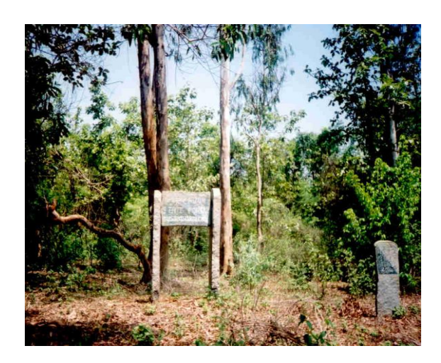
Fig 4: Kyasanuru Village in Sorab Taluk, Shimoga District of Karnataka.

implement various preventive & control measures effectively. Health department, Veterinary Public Health department, Forest and Wild life departments, Vector control division, District administration, Tribal welfare, Fire control departments, and many more are the key stake holders in its control. Each of the stakeholders has to be clear about their roles and responsibilities. Meticulous division of labour amongst all these departments is essential to have more coordinated efforts. State & district authority should chalk out responsibilities of various departments.