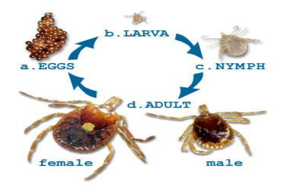
Fig 2: Life Cycle of Hard Tick (Geevarghese G and Mishra AC 2011)

Ticks are obligate haematophagosectoparasites of mammals, birds and reptiles. The major vector ticks Haemophysalis spinigera and H. turturis found to inhabit the forest floors and vegetation and also infest various small mammals and birds. Humans become infected through the bite of infected unfed nymphs, which appear to be more anthropophilic than mature ticks. The KFD virus is transmitted from infected larva to nymph to adult maintain the transovrial and transtadial transmission of virus in the ecosytem.